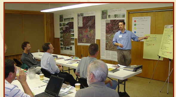
Mountwood Park Stakeholder Meeting